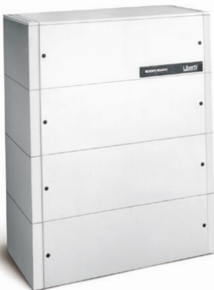
Modular Rack with Panels

C&D's modular racks provide a flexible, efficient method for racking Liberty Series 1000 batteries. These attractive, durable racks provide accessibility to the batteries and are easy to install. Racks are available in 29 inch (73.7 cm) and 43 inch (109.2 cm) lengths and are stackable. Optional panels are available to completely enclose racks, providing a cabinet-like appearance. Please see 12-380 for more information. Complete standby power systems from C&D include batteries, racks, and electronics.