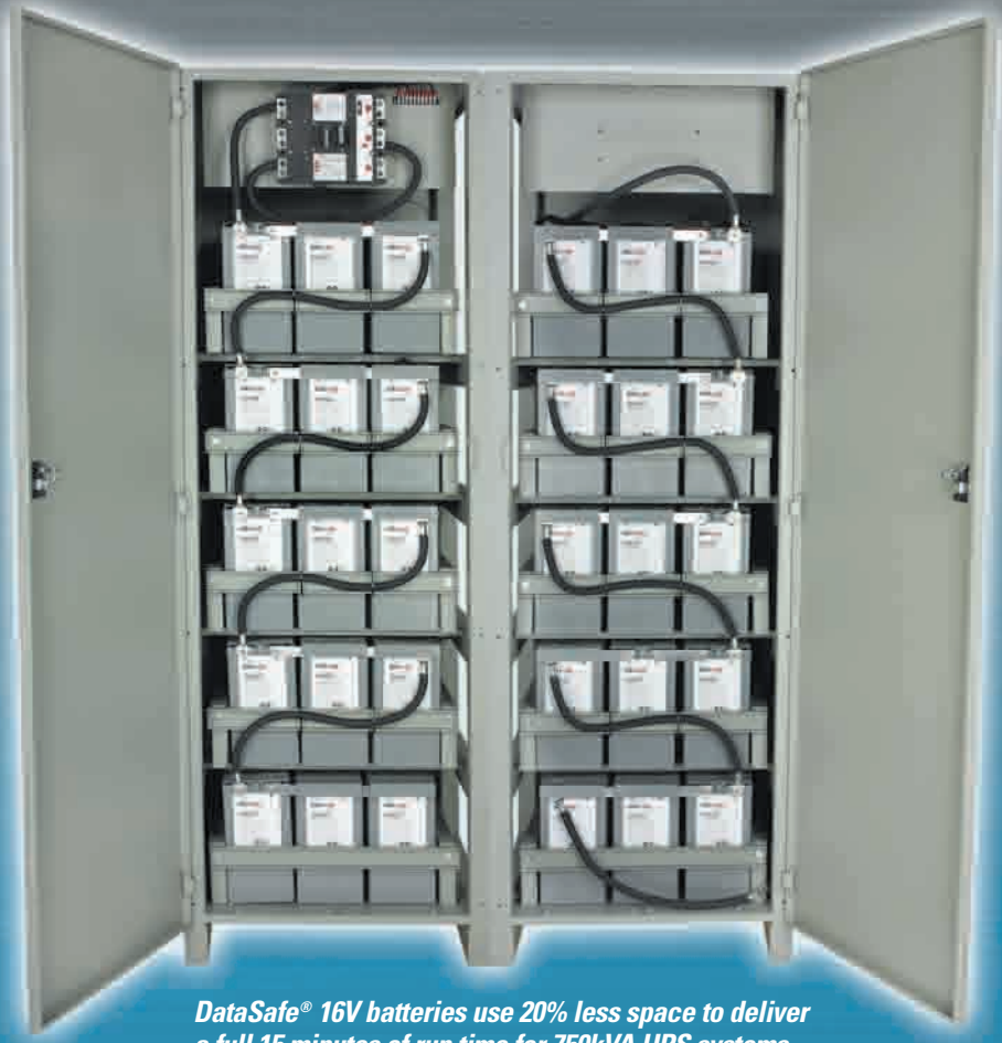
DataSafe® 16V batteries use 20% less space to deliver a full 15 minutes of run time for 750kVA UPS systems.