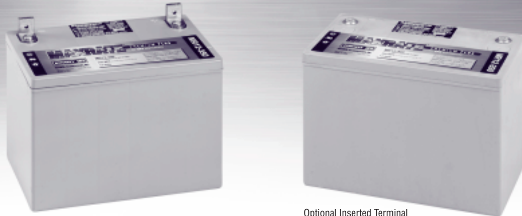
Optional Inserted Terminal Call Factory for Details